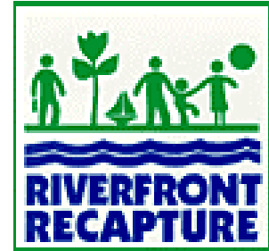
A Non-Profit Organization