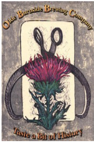
The Olde Burnside Brewing Company